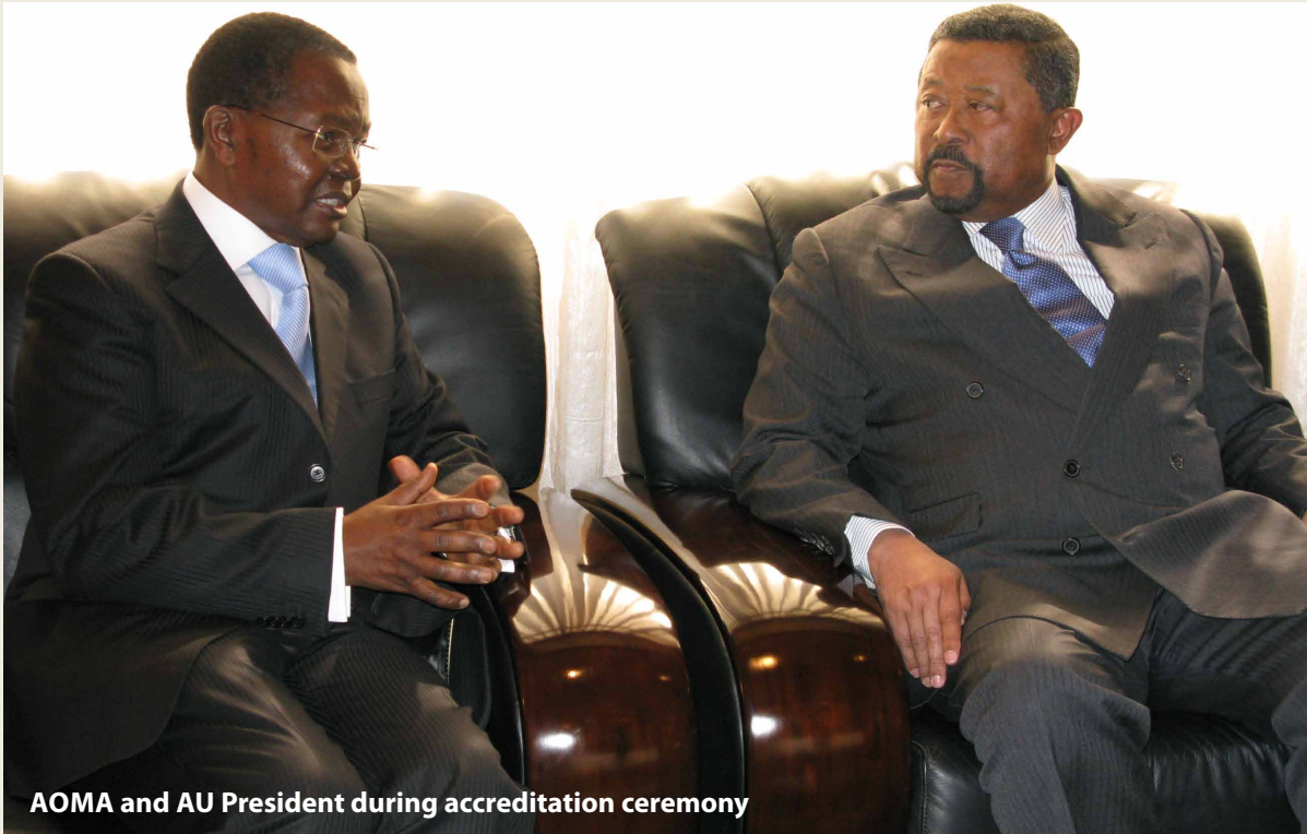
AOMA and AU President during accreditation ceremony