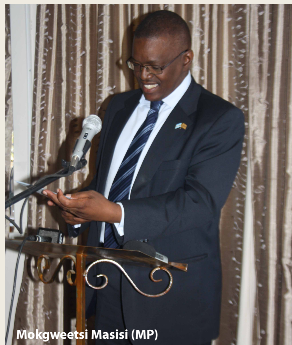
Mokgweetsi Masisi (MP)

The Minister for Presidential Affairs and Public Ad-