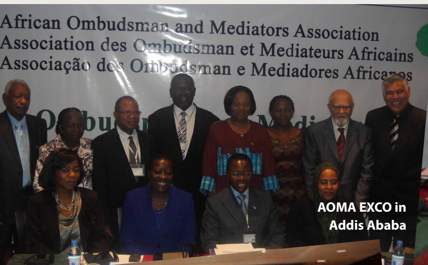
AOMA EXCO in Addis Ababa