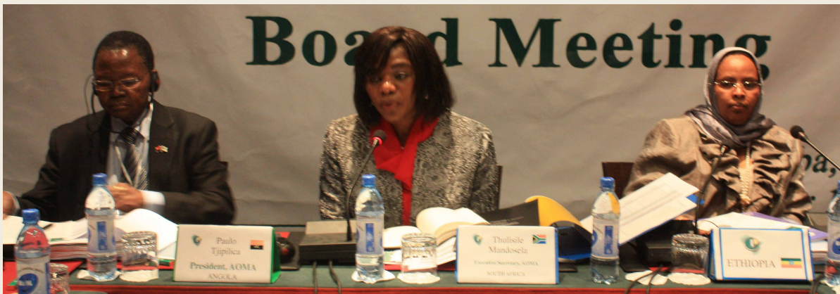
AOMA President, Executive Secretary and Ethiopian Ombudsman open the AORC Board meeting

ADDIS ABABA HAD the honour of hosting the first AORC Board meeting on 14 September 2011 since its launch in March 2011 and the assumption of duty of the AORC staff on 1 June 2011. At this meeting, AORC programmes were discussed in line with the AOMA strategies. The AOMA EXCO that followed resolved that members should support AORC financially and with other resources, as well as respond to requests by the AORC Secretariat. It was also mooted that