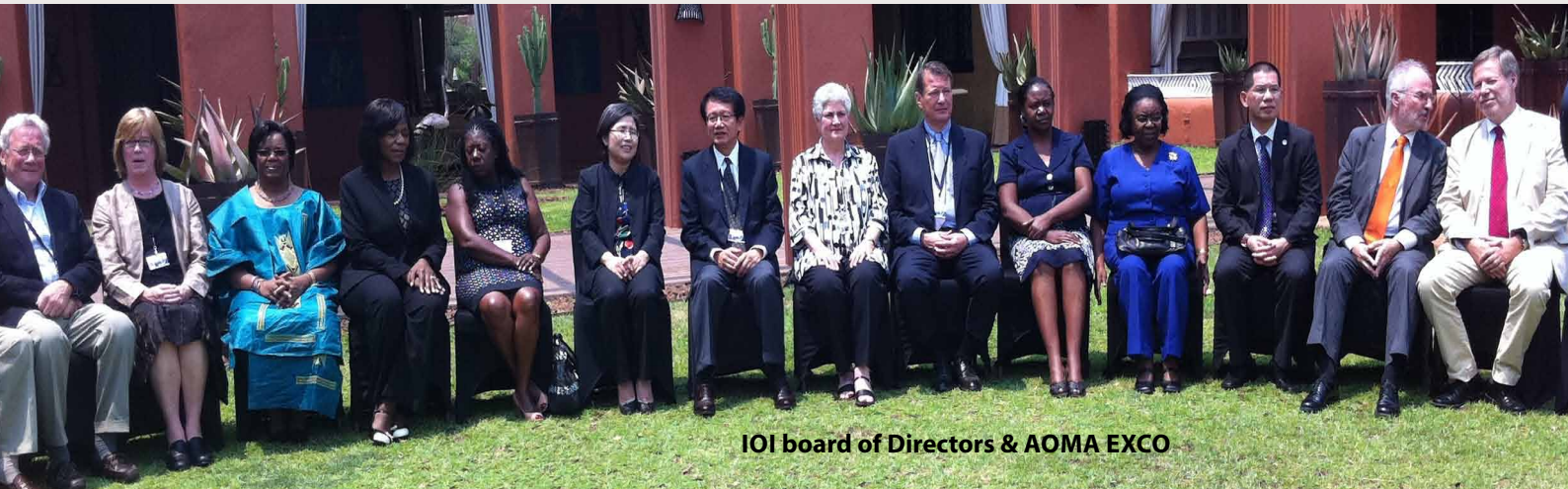
IOI board of Directors & AOMA EXCO