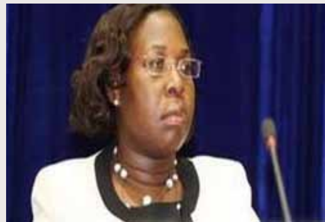
Mozambican Justice Minister, Mrs Benvinda Levy

Even if Mozambique is not a member of AOMA we find it important that we bring you the news of the establishment of the Ombudsman Office in that country, as Mozambique has been an interested participant in the programmes of AOMA. We hope to welcome Mozambique into the AOMA family of nations soon.