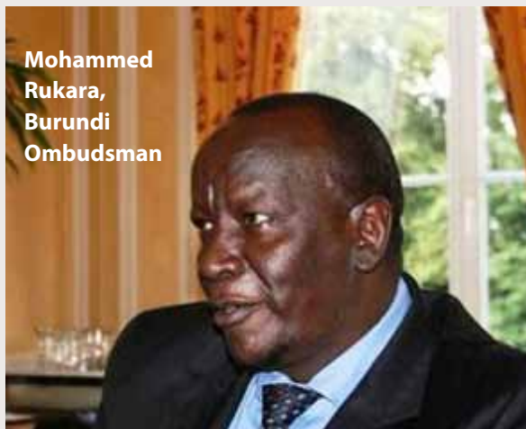
Mohammed Rukara, Burundi Ombudsman

The Ombudsman in Burundi was established in line with the Constitution Post-transition de la République du Burundi, 2005, Article 237). The aim of establishing the Burundian Ombudsman was to investigate violations of civil rights by State officials. The Ombudsman is appointed in terms of Article 237 by the National Assembly with a three-quarters majority and his/her appointment must be ratified by the Senate with a two thirds majority. It is in this line that Mohammed Rukara was appointed.