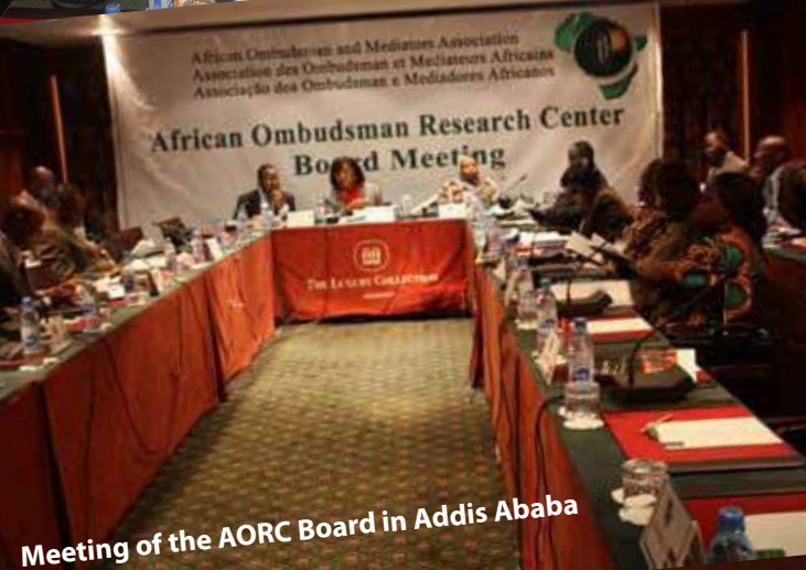
Meeting of the AORC Board in Addis Ababa