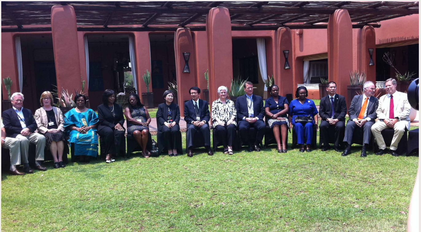
AOMA EXCO meeting with development community