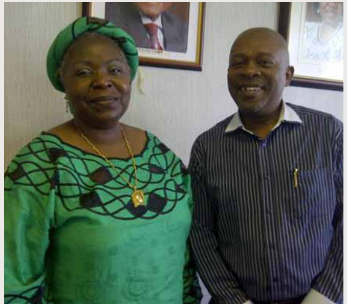
Malawi Ombudsman compares notes with Provincial Rep of Public Protector SA