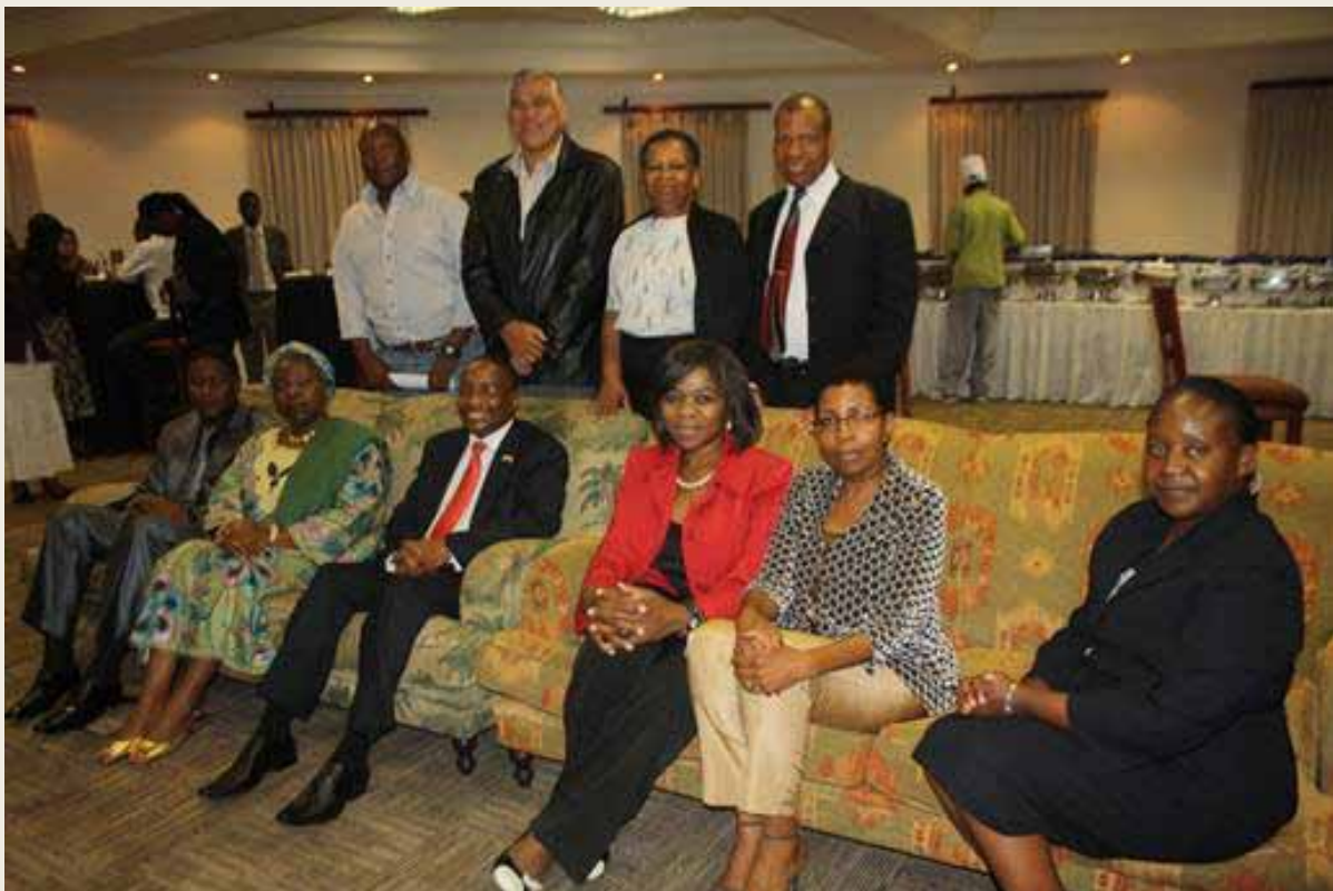
Southern Africa Ombudsman treated to a Dinner hosted by the Acting Ombudsman of Botswana together with the Parliamentary Chairperson of the Committee of Statutory Bodies

Many of our countries have done relatively well in the Mo Ibrahim Index of African Governance 2011, released in September this year. Botswana led all of us at number 3 with South Africa, Namibia and Lesotho close behind at numbers, 5, 6 and 8, respectively. But should we be complacent and bask in the glory of this achievement? What about the fact that Arab spring countries, Tunisia and Egypt, are in the top 10 of the good governance upholders?”