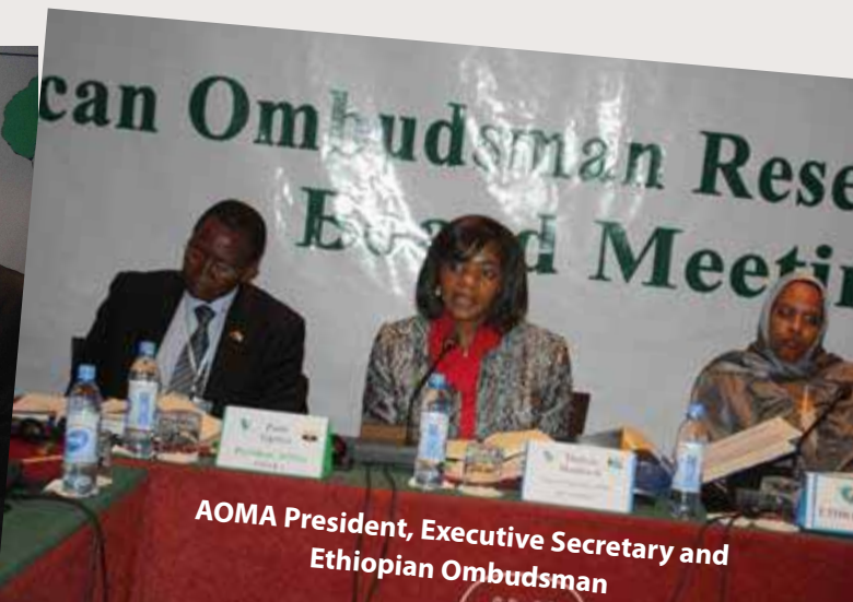
AOMA President, Executive Secretary and Ethiopian Ombudsman